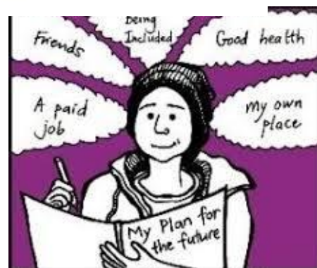
Preparing for Adulthood